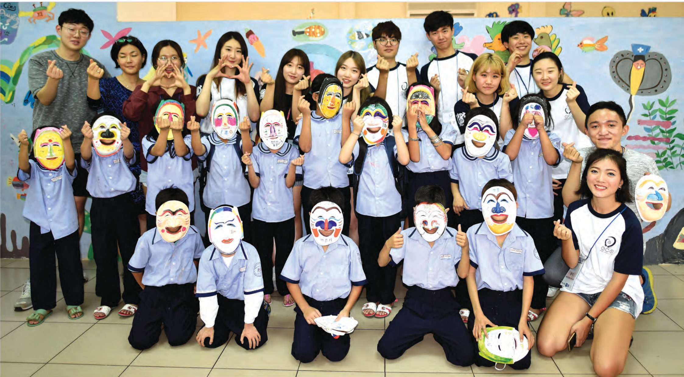
Photo: Volunteer students from Seoul National Academy, South Korea